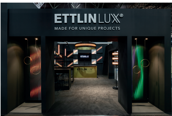
10. Typical for Ettlin Lux are the dynamic light boxes with depth-effective light effects, decorating the entrance area of the exhibition stand - this kind of design was an inspiration for a shop window design.