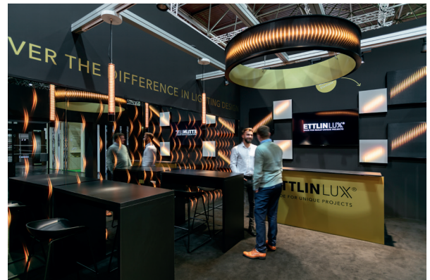
9. The Ettlin Lux booth was clearly convincing with its five metre long mirror wall with integrated three-dimensional lighting effects.