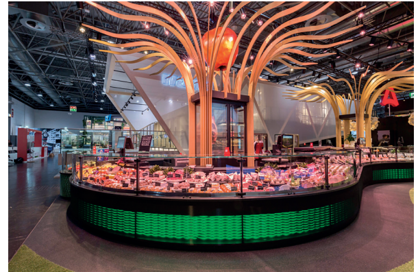
7. At the Aichinger trade fair stand, Ettlin Lux textiles ensure the right staging of sales counters - here in the SIRIUS Swing meat counter.