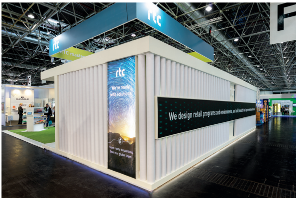
3. The colours turquoise and blue shine in an alternating way on the 12 meter long frame of the rte booth.