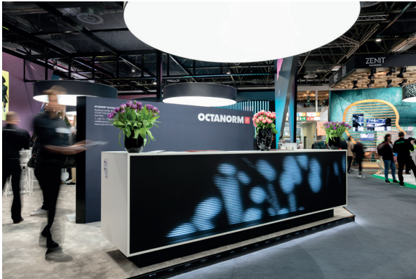
6. Ettlin Lux textiles on the Ocatnorm booth at EuroShop 2020: stretched in front of LED modules, the counter displays three-dimensional shapes in a dynamic way.