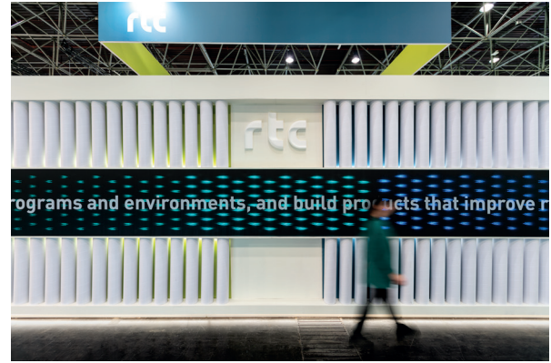
2. A textile frame with changing colour gradient and printed textiles by Ettlin Lux carry the corporate design messages of retail marketing specialist rte.