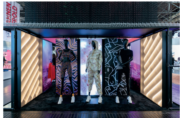
4. Ettlin Lux textiles in Kendu illuminated frames inspire the visitors of the Kendu booth to arrange shop windows.