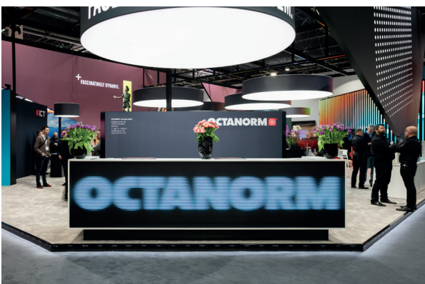
5. Dynamic staging of a counter: with LED technology and technical textiles in the front, this counter's front creates an eye-catching effect as soon as you enter the Octanorm stand.