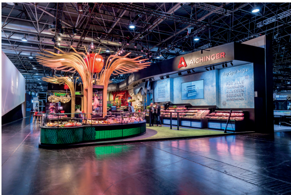
8. Whether curved or straight counters - the lighting effects and textiles of Ettlin Lux are variable and versatile.