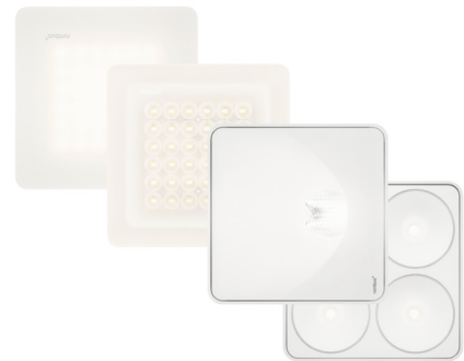
The new Nimbus Q One and Q Four wall spots and ceiling luminaires provide brilliant, directed light and complement the Modul Q 36 Frame and Cubic 36 Frame ranges. All edges are 128 x 128 mm long.

Q One and Q Four deliver brilliant accentuating light with pinpoint accuracy at a beam angle of 40° or 80°, thus complementing the proven Modul Q 36 Frame and Cubic 36 Frame used for uniform or diffuse general lighting. That means it is now possible to meet all lighting requirements in a room with Nimbus products and to realise harmonious lighting from a single source. Dietrich F. Brennenstuhl: "Our goal was to complete our toolbox for lighting designers with Q One and Q Four."