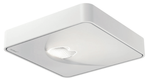
Q One, here in elegant matt white, provides brilliant, warm-white accentuating light. Ideal for accentuating walls in corridors and living spaces.